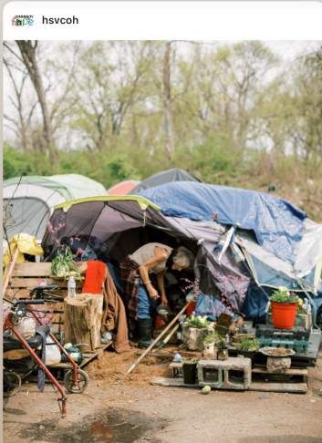
hsvcoH We have a real problem in our community but, we have a real solution! To learn more, click the link in our bio o...

Click on an image below to see our latest updates!