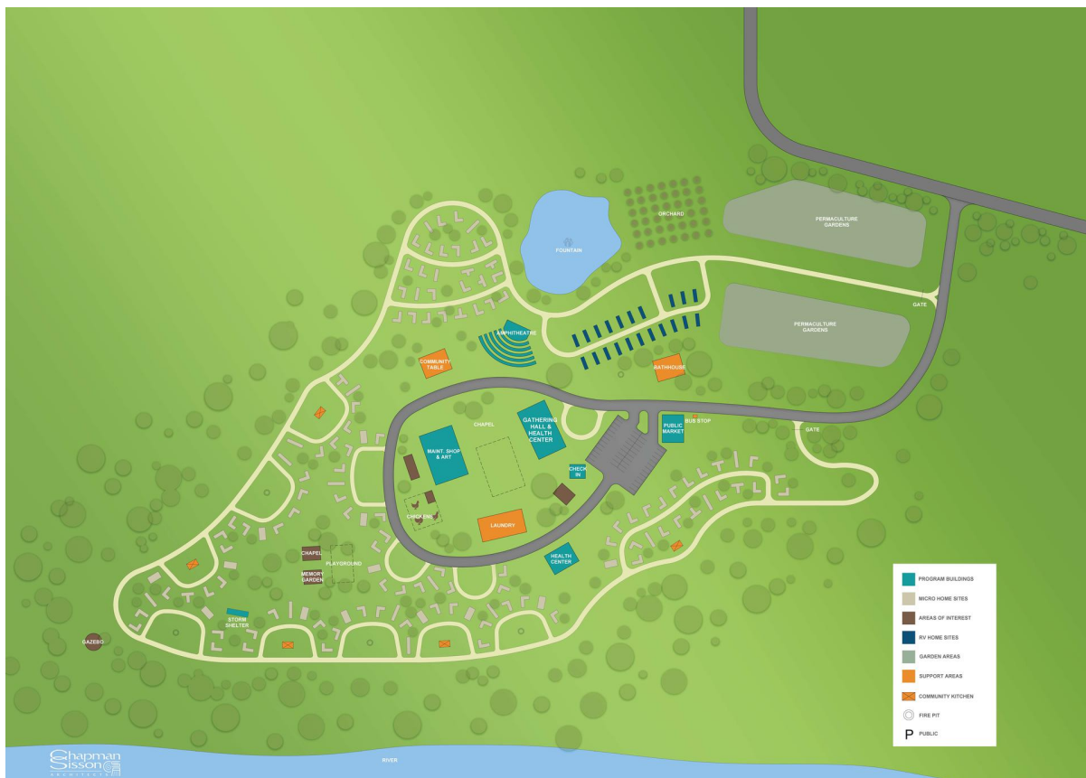
Above: Community of Hope's master planned community plat.

An EXCITING year ahead! A Message From Our Founder